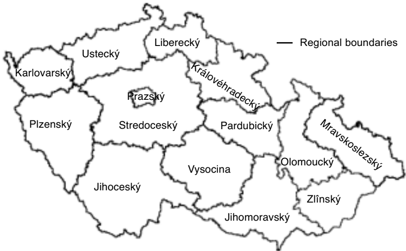
Map 1: Higher Self-Governing Regions in the Czech Republic

The EU's impact on the regional reform debate is difficult to determine with any degree of precision. The Commission strongly favoured the exist-